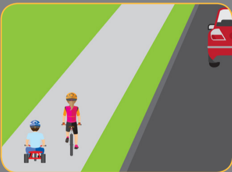
Children under the age of 16.