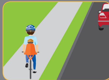
Children under 10 on their parents bike.