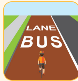
Bus lane Riders can use the bus lane, but NOT a bus ONLY lane