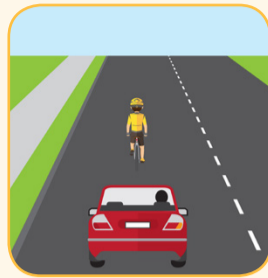
Road Riders can cycle in the middle of the road. This is called "taking the lane"