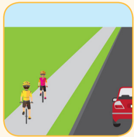
Footpath for children up to 16 and supervising adults. See website for more.