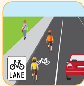
Bike lane Riders must use a bike lane if available, unless impracticable to do so.