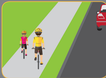
An adult (18 or over) supervising a child under 16. A person who has a medical certificate.