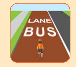
Bus lane Riders can use the bus lane. but not a BUS ONLY lane.