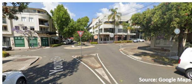
Figure 1: The existing intersection of Young St and Grosvenor St.