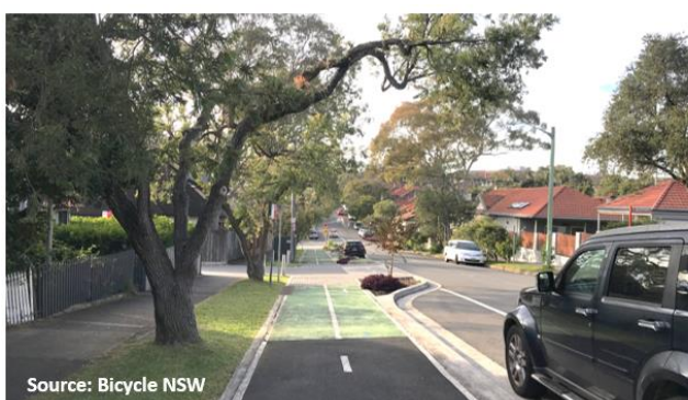
Figure 2: Existing cycle path on Sutherland / Young St is raised to pavement level and protected from vehicle traffic by a parking and landscape buffer.