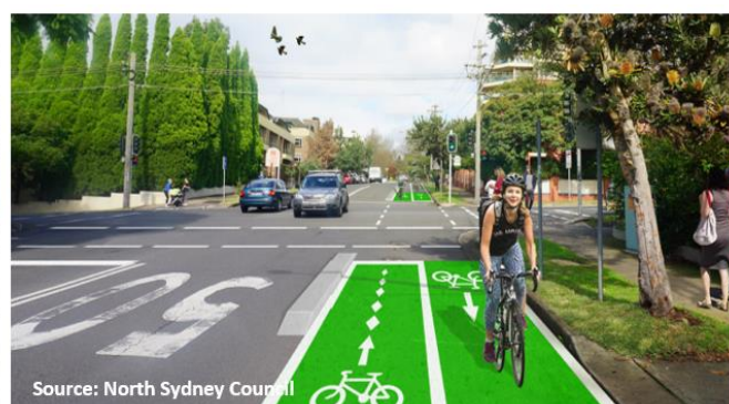
Figure 3: Artist's impression of the extended Young St cycle path, shown at road level with no parking or landscape buffer.