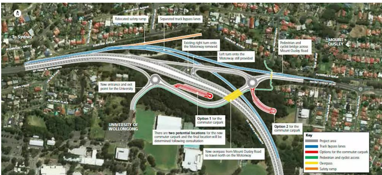
Figure 1: Plans released by RMS in June 2016

Plans from 2016 (Figure 1) clearly show the location of the bridge.